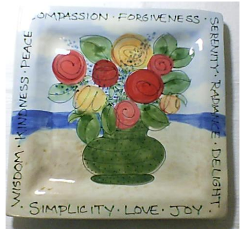
Youngman's New Wide Rim Slab Blessing Platters